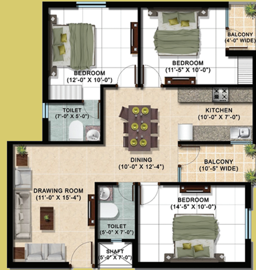
TYPE 3 3BHK + 2 TOILET BUA : 1039 Sq.ft SBUA : 1247 Sq.ft