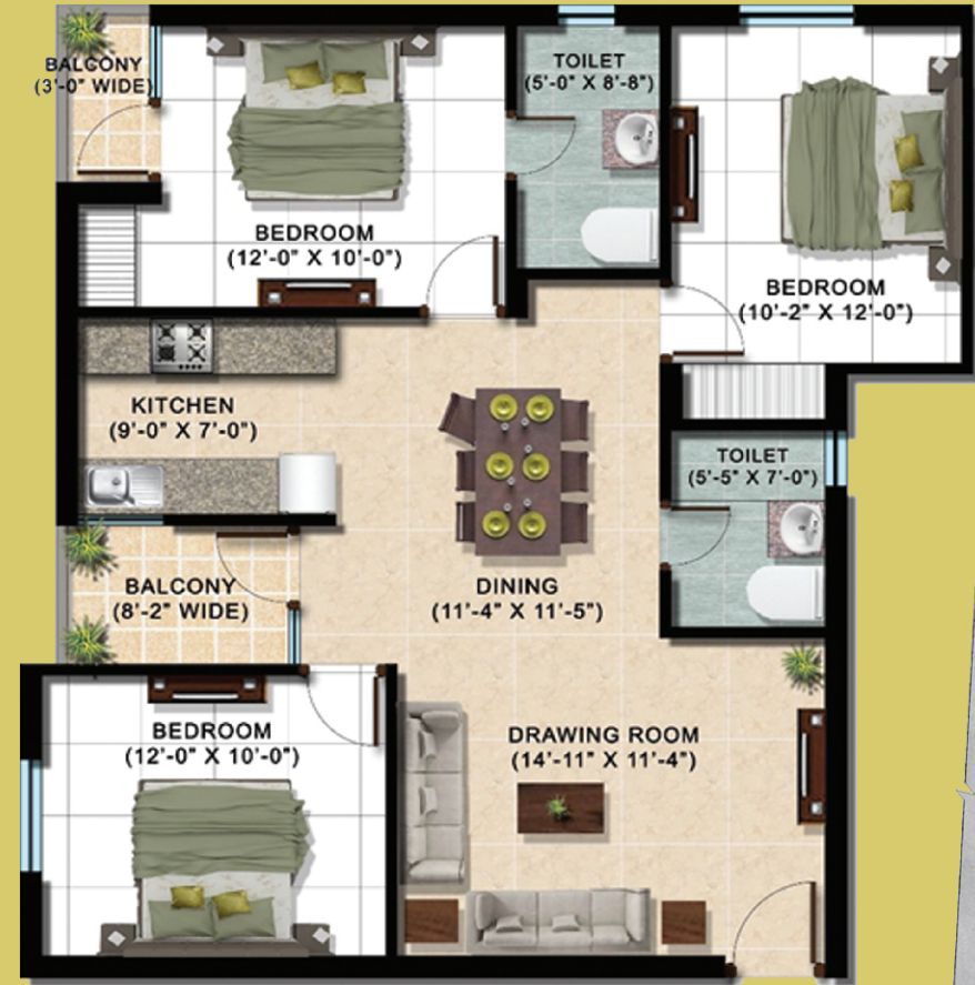
TYPE 2 3BHK + 2 TOILET BUA : 1009 Sq.ft SBUA : 1210 Sq.ft