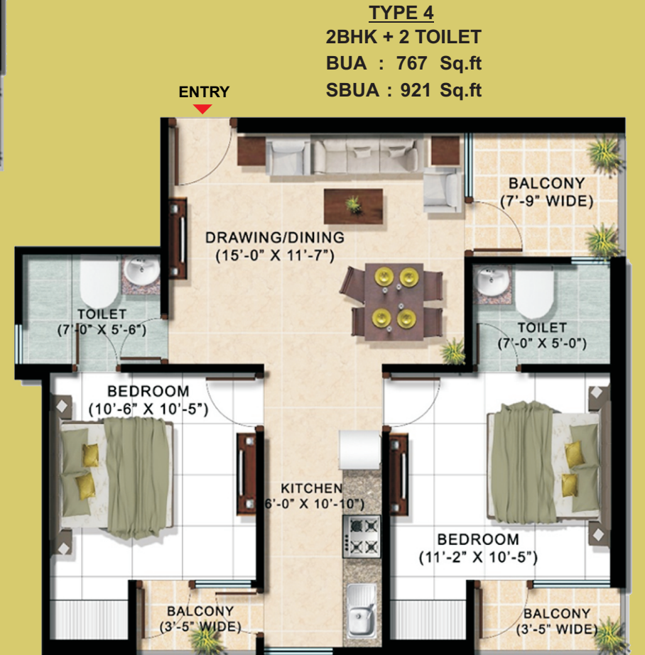
TYPE 4 2BHK + 2 TOILET BUA : 767 Sq.ft SBUA : 921 Sq.ft