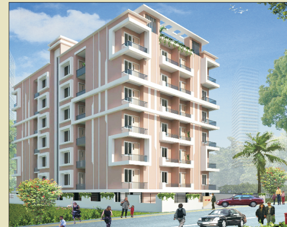
Gayatri Kunj - 2